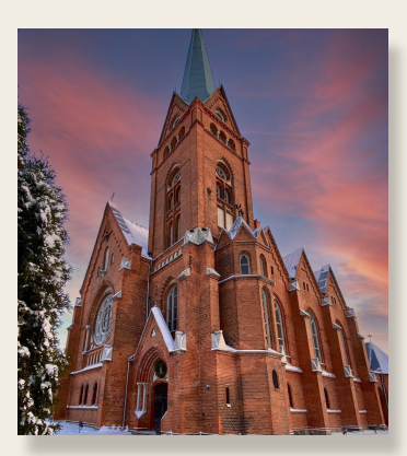
18. novembra street 66

It is believed that before World War II there were very few Germans living in Daugavpils. By providing the information summarized in this booklet, we want to convince the inhabitants and guests of our city that, despite the fact that there were not many Germans (about 500 people) until the autumn of 1939, their presence in the city was quite noticeable. Although almost 100 years have passed since then, we have been able to find out where the Germans lived, what their lifestyle was like, and what their occupations were. For the time being, the information is rather fragmented and has been collected from a variety of sources. We hope that we will be able to continue the work started, gradually creating a more complete picture. This is an offer of a small, unusual tour of Daugavpils, where we will try to tell and show the unofficial life of Germans in Daugavpils shortly before their departure from Latvia.