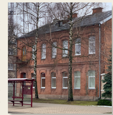
Varšavas street 15

In the house No 31 on 18. Novembra Street, which has not survived to this day, there lived two sisters, who were among the first in our city to take the decision to leave Latvia for Germany. That was evidenced by an advertisement for the sale of furniture published in the newspaper in October, 1939.