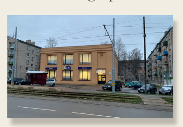
Ventspils street 67/69 pass unnoticed.

Germans also lived in other parts of our city, for example, on Lielā Dārza St., Vienības St., A. Pumpura St., etc., which confirms their presence in Daugavpils and allows to understand the role and significance