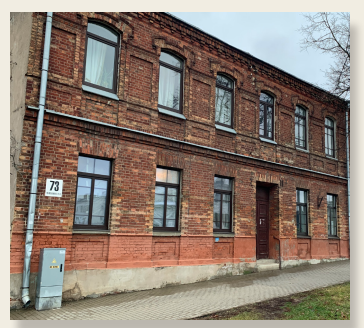
18. novembra street 73

and a park; the houses have not survived and the appearance of the street has changed but we can still imagine how city residents, especially the residents of Raiņa Street, went to Kārlis Blūzmanis' garden cafe-restaurant, which was located in the place of today's small green area.