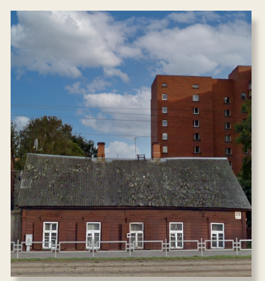
18. novembra street 120

The part of the city called Jaunbuve was very popular with the German population. Not only was