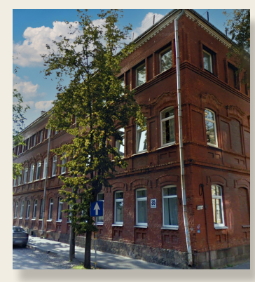
Kr. Valdemāra street 35

The German Parents' Association maintained a German private school (Primary School No. 18) in Daugavpils. Its address was 35 K. Valdemāra Street<sup>(3)</sup>. The house was rebuilt and has been preserved. The school activities were supported by the entire local German community, therefore for school events the spacious premises of Daugavpils City