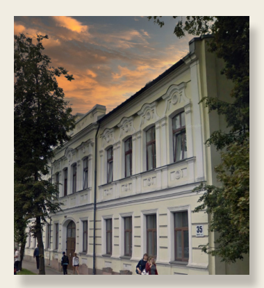
Imantas street 35

Before World War II, more than 500 Germans lived in Daugavpils, which was a little over one percent of the city's total population. This ethnic community had its own meeting places.