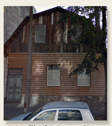
Cietokšņa street 6

Two German families, at least seven people, lived in the 6th house on the same street<sup>(6)</sup>. One of them was a representative of a beer warehouse and, as was customary at the time, he welcomed guests right at his home. A young man from that German family died near Lviv. The house has been renovated preserving its old foundation.