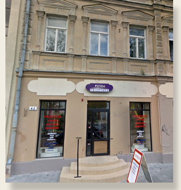
Rīgas street 42

Club at 31 Imantas Street were used. The building of the City Club, rich in tradition, has been rebuilt and preserved.