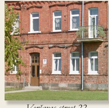
Veršavas street 22